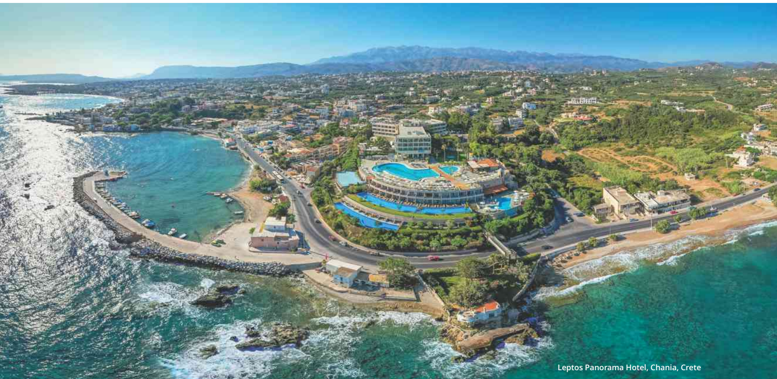
Leptos Panorama Hotel, Chania, Crete

The Leptos Group is a leading organisation in Land and Building Development and Real Estate, as well as Travel and Tourism, Healthcare and Education, with a success history of over 64 years. The Group has achieved its leading position through the professionalism and team effort of its employees and its international network of sales service in 75+ countries, its vast investment in land purchasing and an effective after-sales service support.